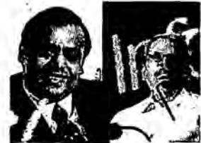
Reliance Industries, Infosys below par, but replacements not in sight