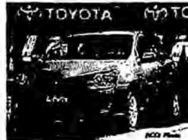
Toyota Etios Liva launched at Rs 3.99 lakh onwards