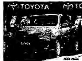
Toyota Etios Liva launched at Rs 3.99 lakh onwards