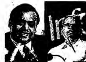
Reliance Industries. Infosys below par, but replacements not in sight