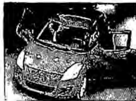
Maruti stops production of Swift hatchback, to relaunch new version by September